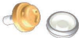
LOCATOR Implant Abutment and titanium Denture Cap with clear nylon Replacement Male

The LOCATOR Implant Attachment is available in stock to fit all major implant systems. LOCATOR Implant Abutments for overdenture applications are available in numerous tissue cuff heights. Choose the corresponding abutment tissue cuff height that exactly equals the tissue measurement, or the next higher size. With proper tissue cuff height selection, the 1.5mm working portion of the attachment will remain above the gingival tissue.