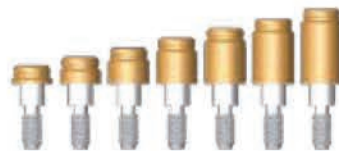
LOCATOR Implant Abutments Many Tissue Cuff Heights are available.

Order by soft tissue height in millimeters