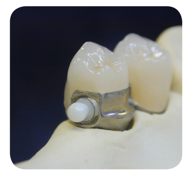
YTZP Zirconia Ball Bond-In Attachment System

XPdent Corporation, the exclusive distributor of Bredent products in the U.S. is proud to announce the new precision engineered, YTZP Zirconia Ball Attachment that is used in conjunction with the VKS-SG's retentive matrices. XPdent's zirconia ball provides the same functional and aesthetic benefits that a cast alloy attachment does without the susceptibility of direct wear or breakage due to the high fracture toughness (1,200mpa) and low wear features of YTZP zirconia. Dental technicians can incorporate the YTZP zirconia ball patrix into traditional crowns, bridges, implant bars, custom implant abutments and of course, all ceramic restorations for totally specialized combinations of prosthetic and restorative work. Available in a 2.2mm diameter ball, the YTZP Zirconia Ball takes attachment cases to the next level by offering patients optimal aesthetics, biocompatibility and a wear resistance that only yttrium stabilized zirconia can provide.