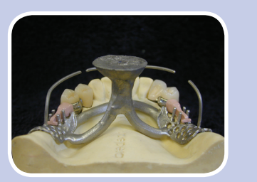
Invest using the same investment used to pour the refractory model. Cast, fit and finish the frame as usual.