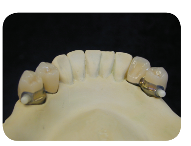
YTZP Zirconia Ball Bond-In Attachment System

Over the years, most of the problems with any attachment are due to poorly designed or fitting RPDs; specifically, frames without proper reciprocating arms. For this reason, we would like to recommend the following technique. The fabrication of a precision attachment RPD with custom metal housings and lingual arms, as separate components, provides many restorative benefits for the dental technician and dentist. This technique allows technicians to fabricate highly accurate and stress free partial frames while sustaining an easier degree of serviceability and retieveablity of the attachment housings/females when necessary. When using the VKS-SG system for fixed-removable combination cases, it is important to have an exact fitting reciprocating lingual arm and shoulder rest with an interlocking vertical groove. The main function of these is to divert occlusal loading forces away from the attachment ball and center them down the long axis of the tooth.