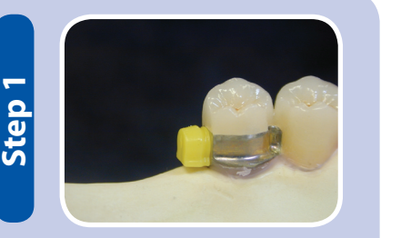
Snap VKS-SG 2.2mm Yellow Matrices over the ball attachments.