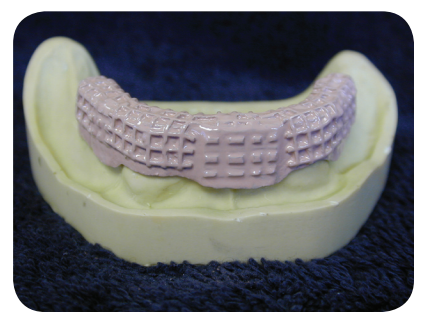
YTZP Zirconia Ball Bond-In Attachment System